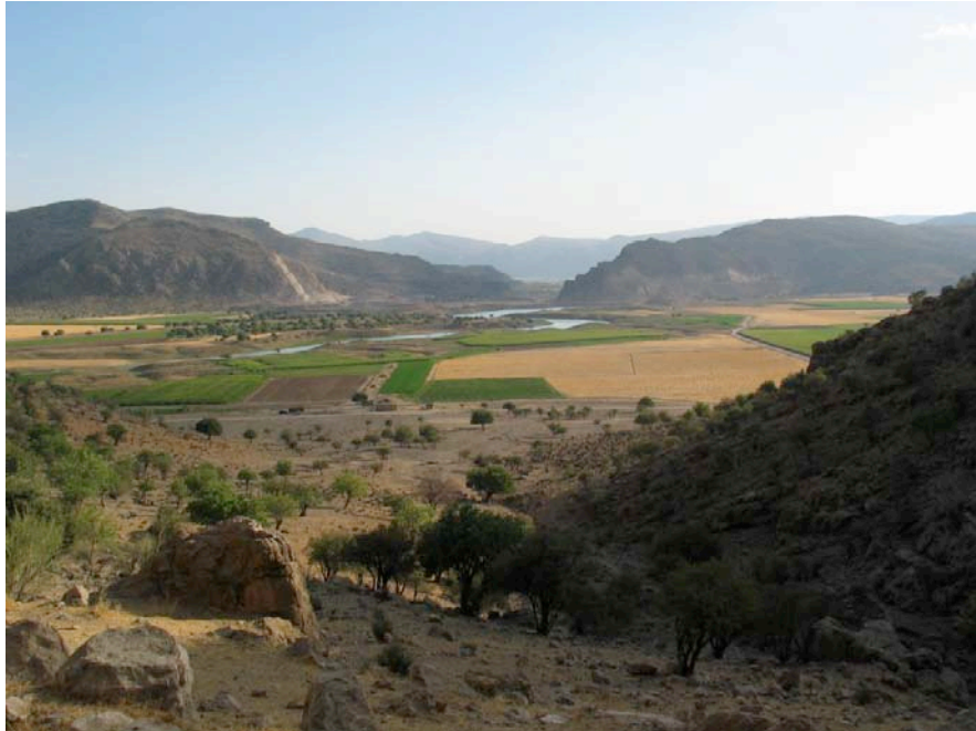
Fig. 3: The plain of Darreh Bulaghi as it was in 2005-07 before the completion of the dam. The fields were productive thanks to mechanical irrigation. The piedmont and the slopes of the mountains were covered with bushes and terebinth trees

bering from 8 to more than 15 people, having an Iranian and a non-Iranian co-director, and including archaeologists and other specialists from both countries. The teams conducted two seasons, sometimes three, between autumn 2004 and winter 2007, each season lasting from 3 to more than 6 weeks.