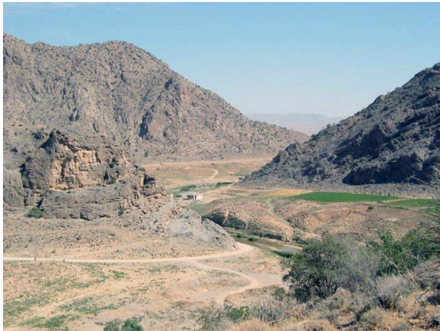
Fig. 2: The upper part of Tang-i Bulaghi along the Pulvar river.